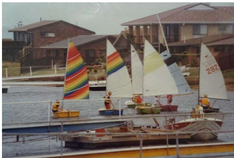
Sunday sailing races on Newport canals c. 1986